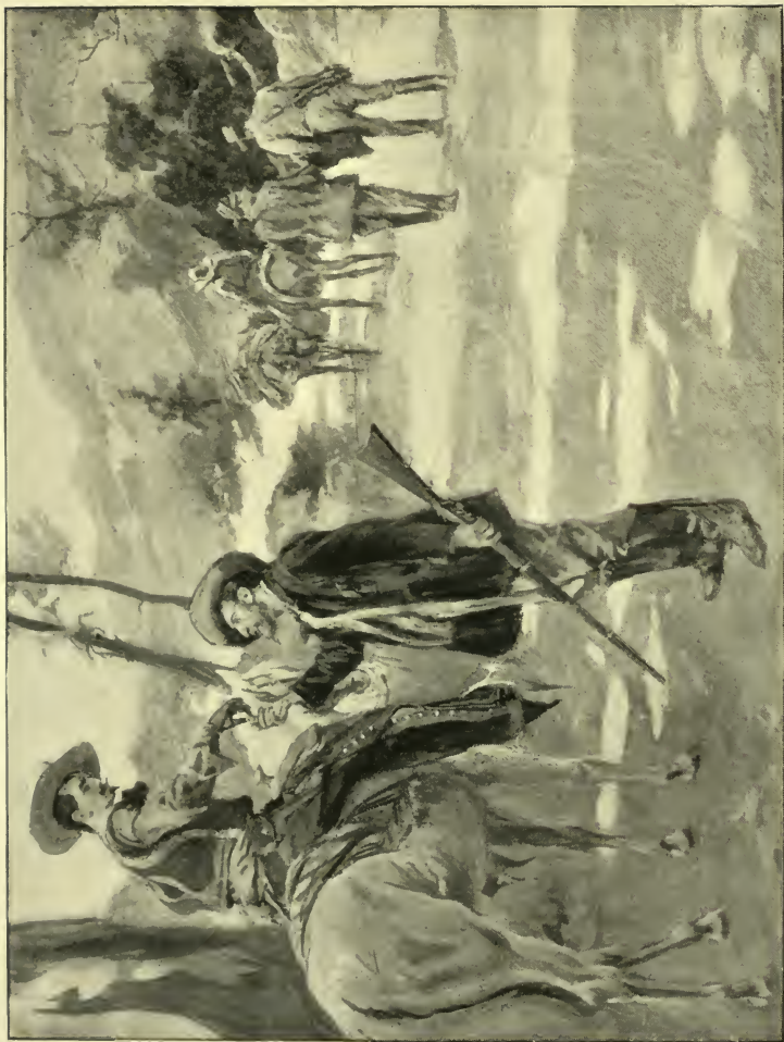
He took from a fold of his scarlet sash a small parcel.